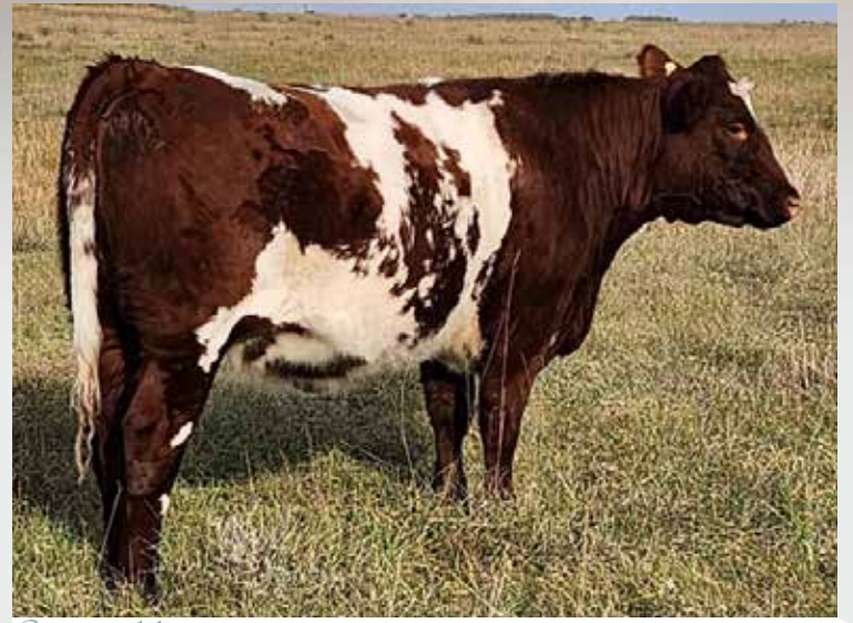
Consigned by Poplar Dell Shorthorns, Edam, SK

Exposed to Clythe Mane Hot Stuff 110H from June 11 - Aug 15. Preg checked to calve mid to late April.