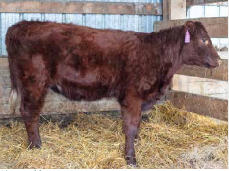
Consigned by Double R Shorthorns, Redvers, SK