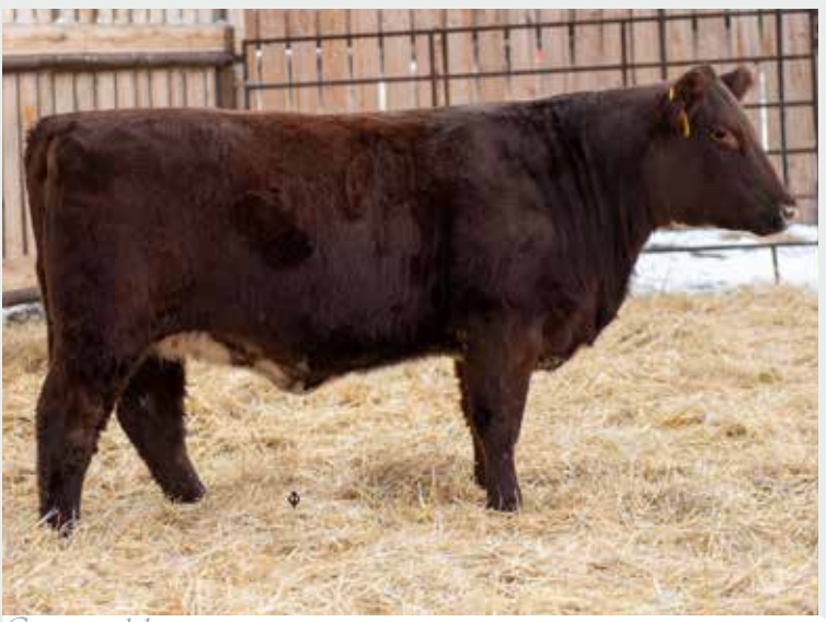
Consigned by Diamond Creek Cattle Co., Weyburn, SK