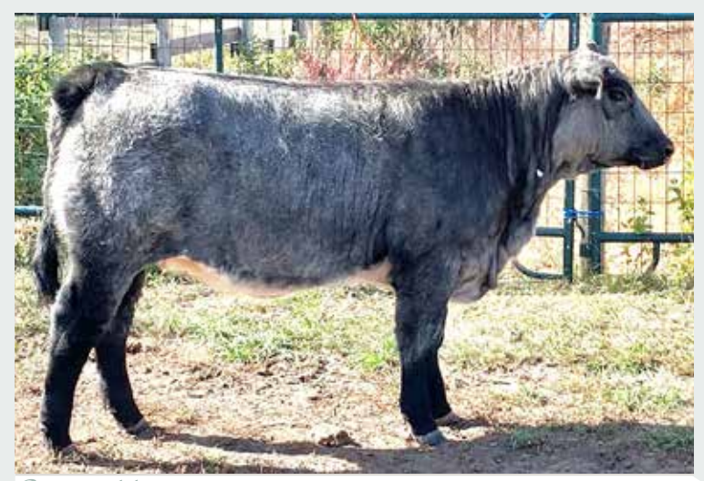
Consigned by Blue Ren Ranch, Grandora, SK

The Francis cow family have been a Gar-Lind staple for a long time. This latest model has been a standout right from birth! She is deep, wide and has enough length to balance everything out. We liked this mating so much we did it twice! Full sister in the bred heifer pen.