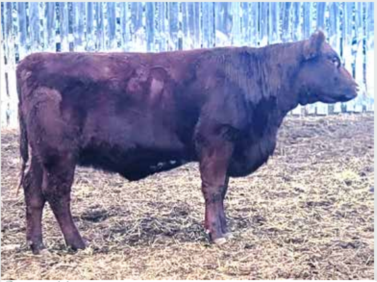
Consigned by Gar-Lind Shorthorns, North Battleford, SK