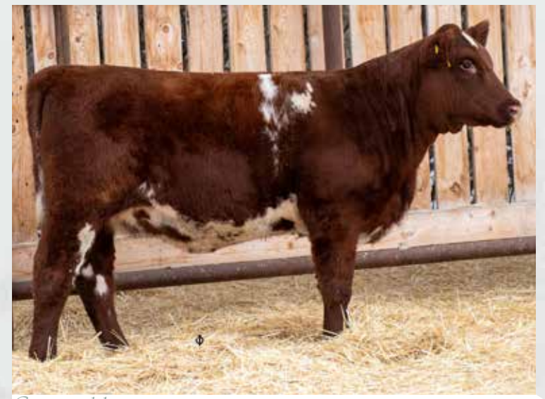
Consigned by Diamond Creek Cattle Co., Weyburn, SK

Another Millicent daughter out of our herd sire Hercules. A clean fronted heifer with tons of thickness and style. She is backed by a line of females with flawless udders and exceptional milking abilities. 81L has the qualities that can take her in any direction.