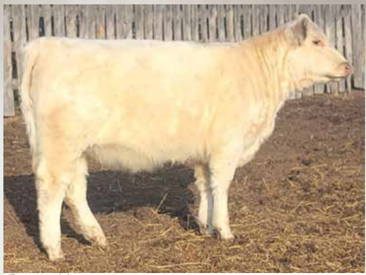
Consigned by Gar-Lind Shorthorns, North Battleford, SK