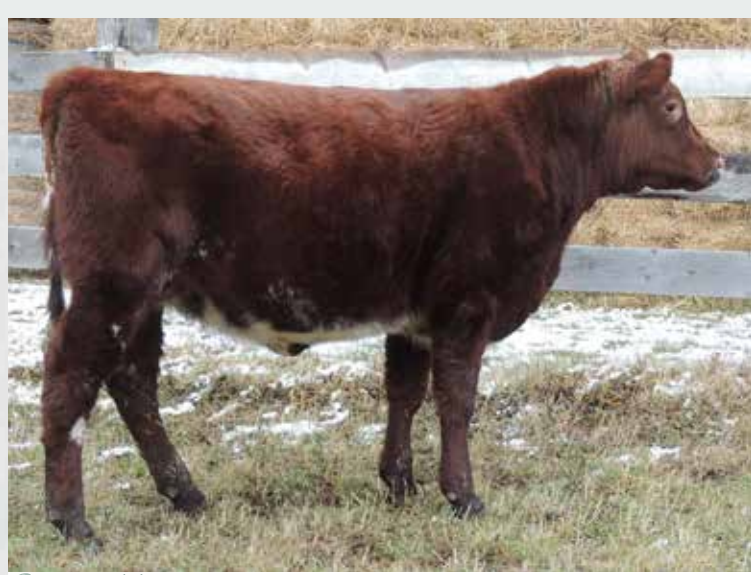
Consigned by Bell M Farms, Englefeld, SK