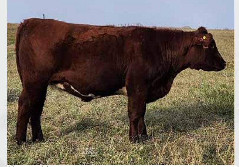
Consigned by Poplar Dell Shorthorns, Edam, SK

Exposed to Clythe Mane Hot Stuff 110H from June 11 - Aug 15. Preg checked to calve mid to late April.