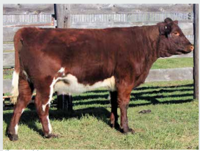
Consigned by Bar 33 Ranch, Pierceland, SK