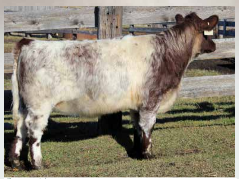
Consigned by Bar 33 Ranch, Pierceland, SK

Double R Daffodil 11L is a quiet red and white heifer that will make a great addition to any herd. She is smaller framed with just the right amount of depth to her. Her dam is one of the very first purebred Shorthorns we bought in the 2020 alliance sale a nice deep bodied roan cow. Uphill Daffy 21G. I have two Daughters off 21G in my herd which is the reason 11L is being consigned to the sale as we've seen what this cow can produce and are excited to offer her as one of our first females that we will be selling. She is halter broke and has potential to make a great junior project.