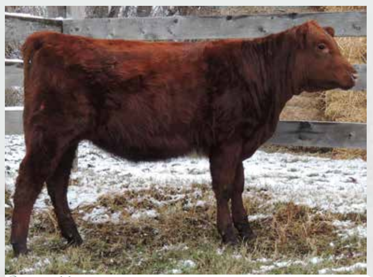
Consigned by Bell M Farms, Englefeld, SK

Some older proven genetics in this sweet made female. We have a few Four Point Major daughters and I wish we had a bunch more, flat out good females! This heifer will carry on that tradition. From the Joyous Jade cow family, no nonsense females.