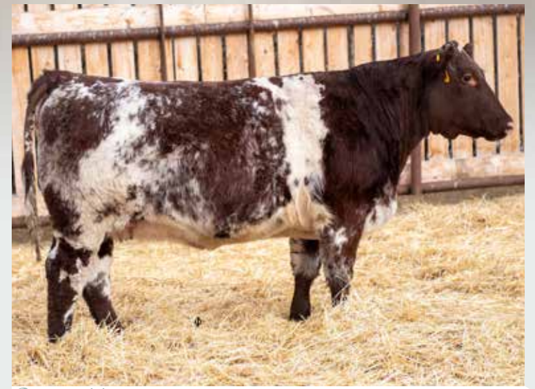
Consigned by Diamond Creek Cattle Co., Weyburn, SK