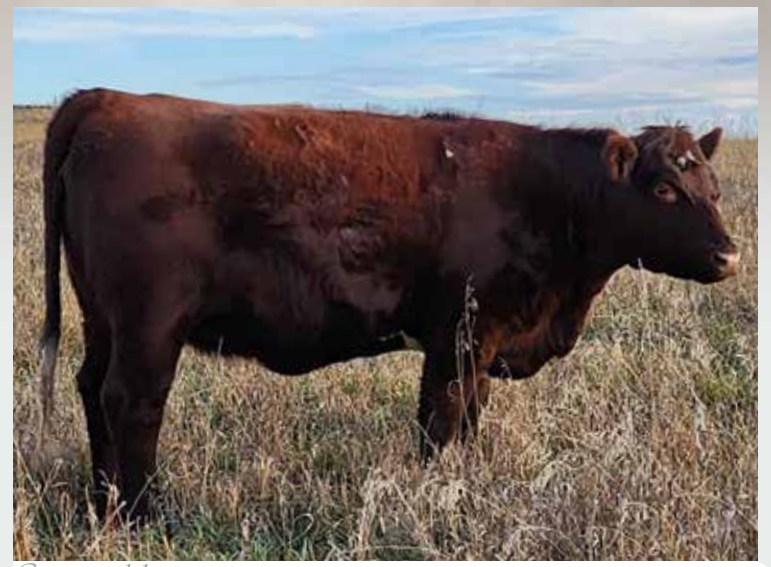
Consigned by Poplar Dell Shorthorns, Edam, SK