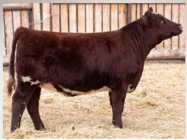
Consigned by Diamond Creek Cattle Co., Weyburn, SK

Millicent has been a favourite all summer. She is extremely good looking with her attractive front end, extra body shape, all while standing on an excellent foot. She comes from one of the top producing cow lines here at DCC. This is a female that will hurt to let go as she should be staying within the purebred cowherd. She comes halter broke and would be excellent for a junior member.