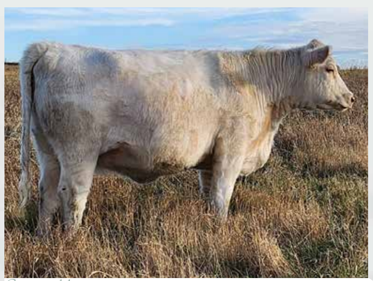
Consigned by Poplar Dell Shorthorns, Edam, SK