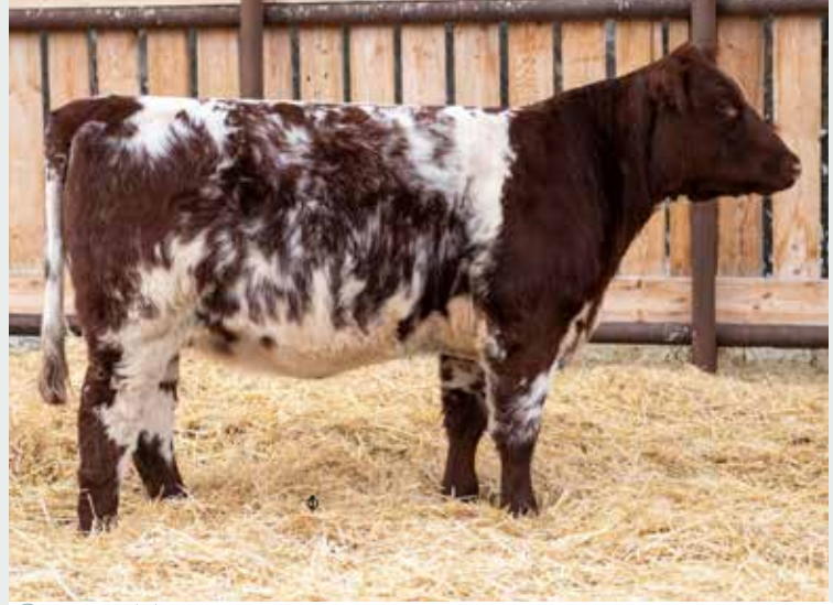
Consigned by Diamond Creek Cattle Co., Weyburn, SK

Here is a flashy roan heifer that has been a standout since day one. A daughter of HC Cruiser 59C that has stamped her with his thickness and capacity. She comes with tons of mass, great foot, and a great disposition. She would be excellent for a junior member.