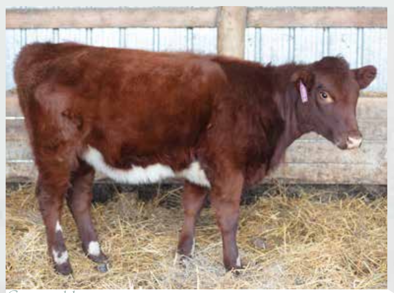
Consigned by Double R Shorthorns, Redvers, SK