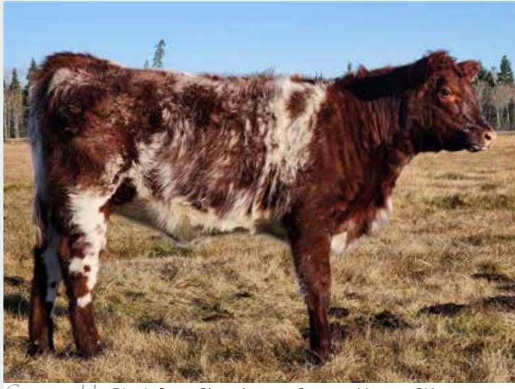
Consigned by Pic-A-Spot Shorthorns, Spruce Home, SK