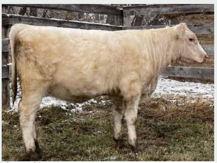
Consigned by Gar-Lind Shorthorns, North Battleford, SK

Consigned by Pic-A-Spot Shorthorns, Spruce Home, SK