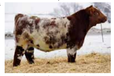
Gilman's Greens Fork 50K

92Y as well as the Juanita's. Shadybrook Juanita 97C has proven herself to be a consistent producer of excellent quality progeny by different sires. Two ET daughters were among the top selling calves in our 2022 Sale and another is our lead show female this year. Gilman's Greens Fork 50 K was purchased at The Summit Sale at the Cattlemen's Congress in January, where he was admired by cattleman of all breeds. He is homozygous polled and free of all genetic conditions. Sired by the popular Byland Flash 9106 and out of Waukaru Lassie 2024, one of the breeds most prolific and value producing donor dams.