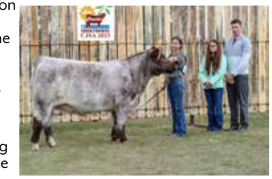
2023 Canadian Junior Shorthorn Supreme National Champion Female

Flush will be completed in Spring of 2024. Guaranteeing 6 freezable embryos with no cap. Half of purchase price must be payed at sale with the rest payable at time of flush