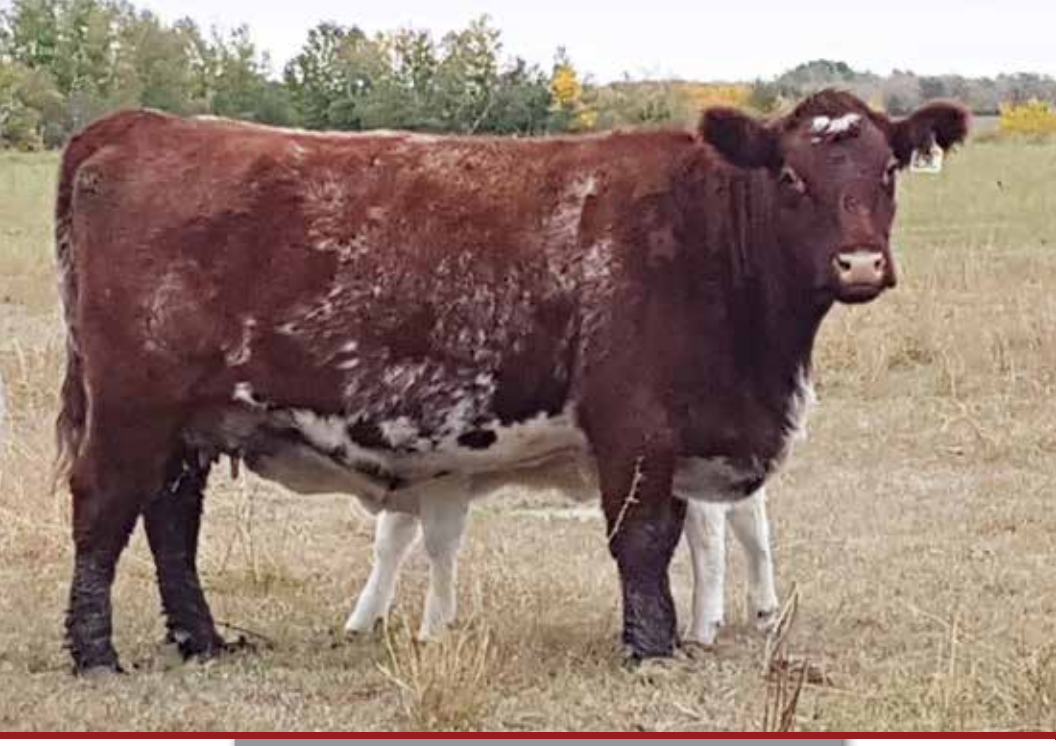
Consigned by: SASKVALLEY STOCK FARM