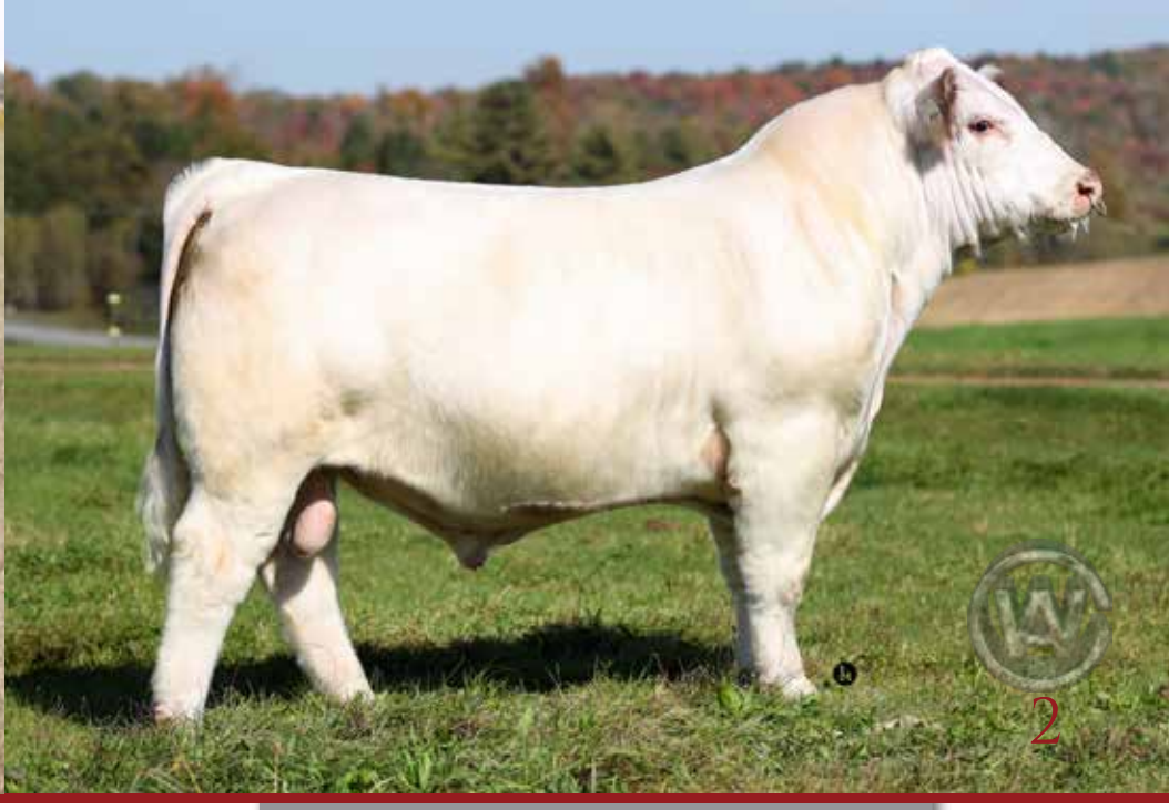
Consigned by: SHADYBROOK FARM

2 SHADYBROOK WHITEOUT 27K X-[CAN]*31021 · Jan 14, 2022 · MAX 27K · White · Polled