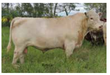
Bell M Foreman 30A

These embryos offer you an opportunity to add genetics economically to your herd that will pay dividends for many years into the future. We will offer the buyer a minimum of 2 pregnancies at 70 days post implantation providing an experienced embryo technician is used.