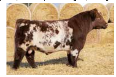
Byland Flash 9U106